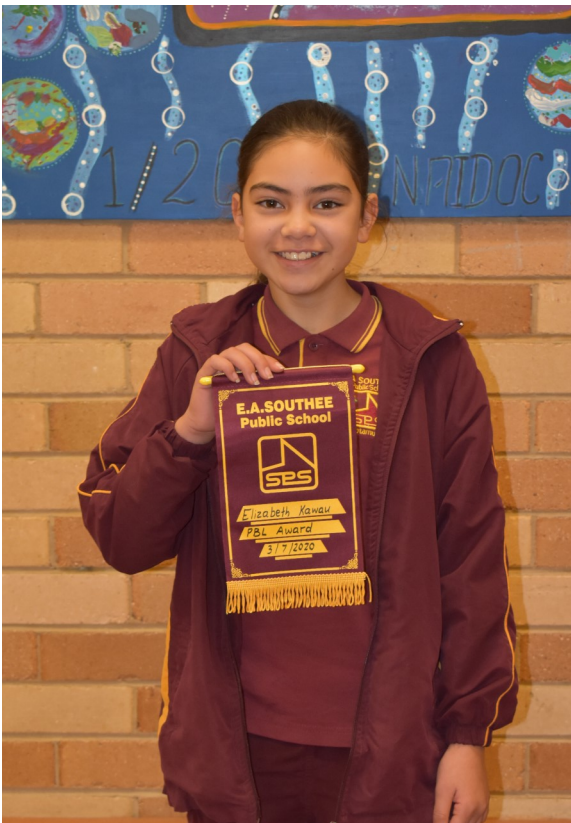
PBL Award Recipient